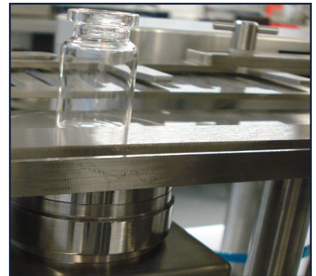
Vial on weighing cell