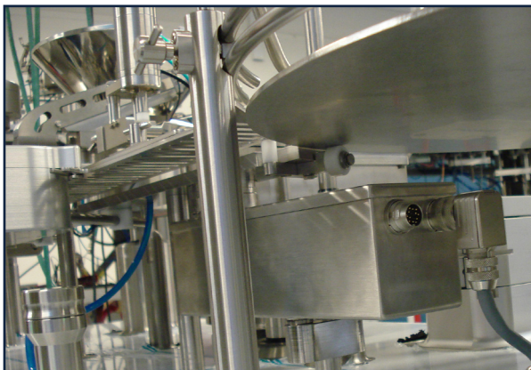
Overview of weighing cell below bottle track